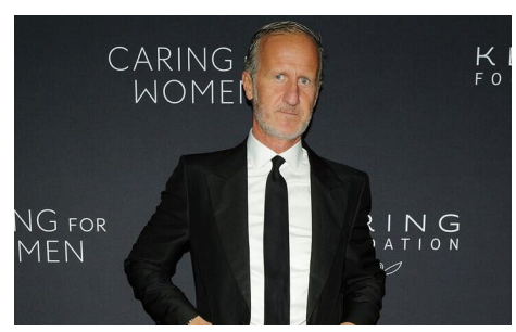
Gucci's New CEO Faces the Challenge of Reviving The Iconic Italian Brand Once Again