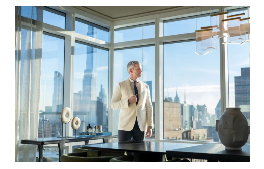
Ryan Serhant Raises $45 Million To Build The Brokerage of The Future